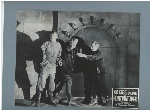
Huntingtower Film - 1927 with Harry Lauder 001