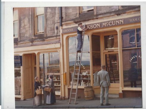
BBC Huntingtower scene