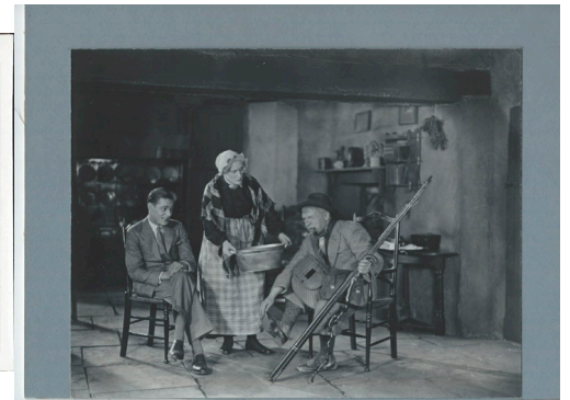
Huntingtower Film Silent version 1927 with Harry Lauder 002